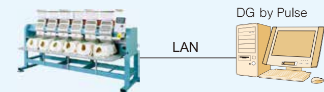
Example of connection

Display a production report on the efficiency of your machines, such as total number of thread breakage etc., and then output the file. The file can be converted to statistical data, using commercially available software.